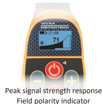
Peak signal strength response Field polarity indicator