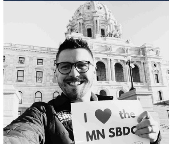
SBDC Day at the Capitol