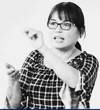
FastTrac Plan It! with Cultural Diversity Resources

Exit Strategy • Quarterly Planning and Issue Management • SBDC Day Road Tour 2023 • Thrive During Construction • Buying a Business • Entrepreneurship Startup Class • Otter Tail Child Care Resource Fair • Atomic Marketing • Greater MN Marketing Summit • eCommerce Essentials - Digital Marketing, Unlocking the Power of Online Advertising • MNwest CEO Forum & Entrepreneur Summit • The Seasonal Impact • eCommerce Essentials - Social Strategy • Corporate Transparency Act Info Session • eCommerce Essentials - Intro to Cybersecurity • eCommerce Essentials - Website Basics • eCommerce Essentials - Protect Your Data • SBDC Day Open House in Moorhead 2024 • SBDC Day at the Capitol in St. Paul 2024 • FastTrac with MMCDC in Becker County • FastTrac•Plan It! Entrepreneurship Course with Cultural Diversity Resources in Moorhead • Women Thrive - Sips, Skills and Solutions to Transform your Entrepreneurial Spirit • many info sessions and more!