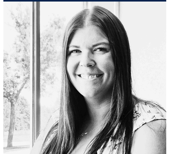
Rolling Blue Logistics