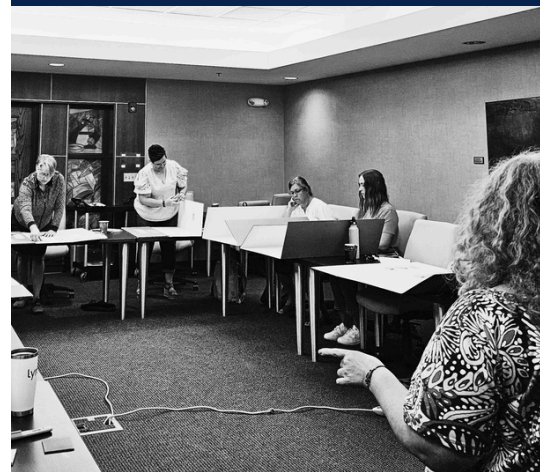
Women Thrive - Moorhead