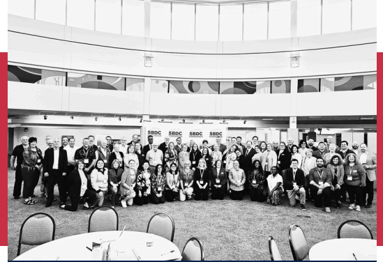
2024 MN SBDC Knowledge Exchange Program