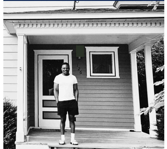
Aziza's Residential Care