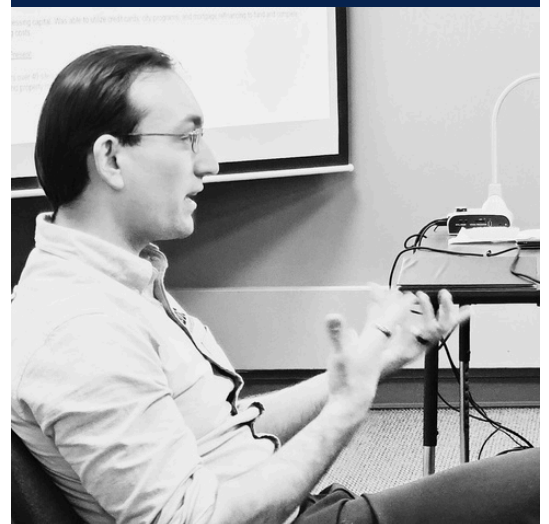
FastTrac in Becker County