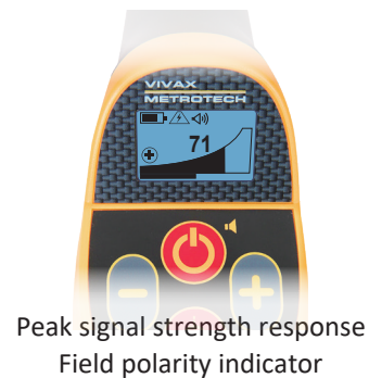
Peak signal strength response Field polarity indicator