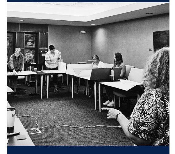
Women Thrive - Moorhead